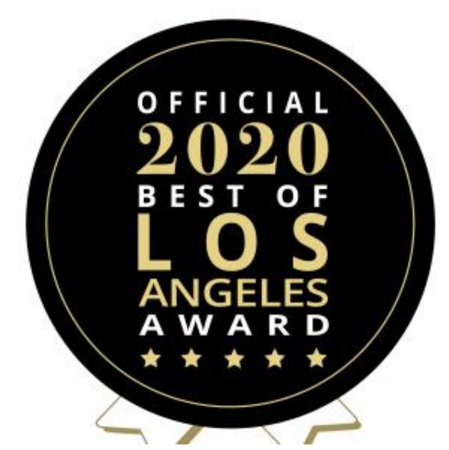
Best of LA Award